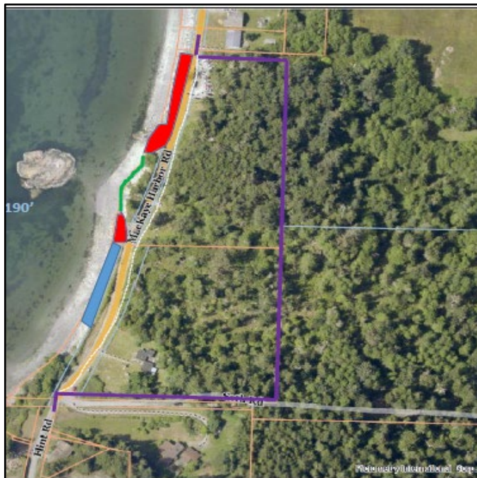
Agate Beach Bluff/Beach Restoration (Lopez Island, San Juan County/FHWA)