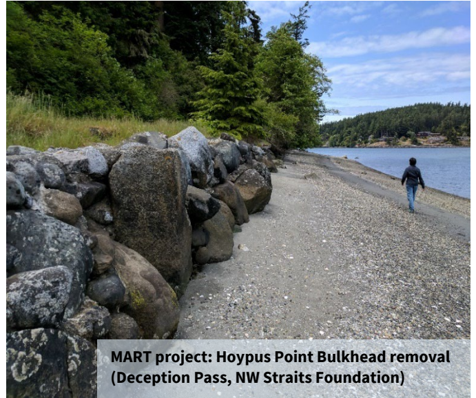
MART project: Hoypus Point Bulkhead removal (Deception Pass, NW Straits Foundation)

The permitting process (local, state and federal) is complex, and several permits are interdependent. If you have a habitat recovery project that is ready to permit, we can assist you with an expedited pathway through the process and provide direct access to a team of permitting agencies that will work with you through the entire process.