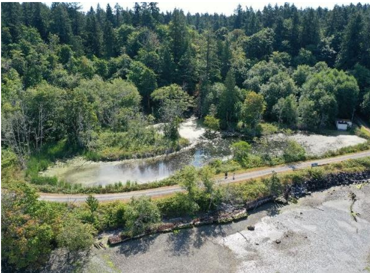
McNeil Island Estuary Restoration-Bodley Creek & Floyds Cove

Project sponsors have worked hard to put together an impressive suite of projects to compete for SRFB funds. Learn more about the 15 projects below. WSPER hosted field visits with the RCO Review Panel in March and have received the initial review status. Of the projects, four are Cleared , nine are Needs More Information , and two are Project of Concern .