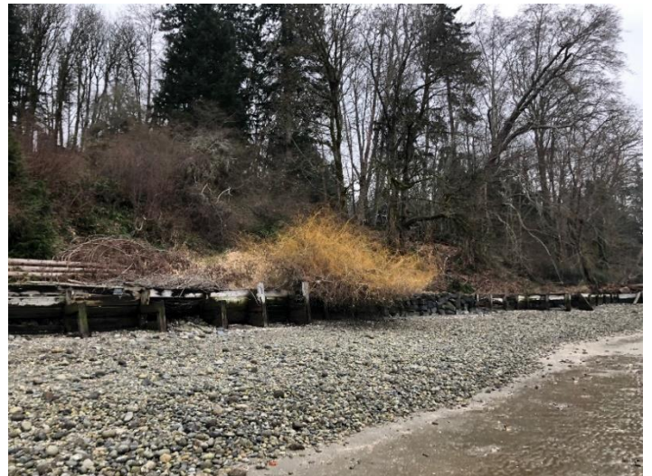
Henderson Bay Armor Removal Design

Sponsor: Washington Department of Fish and Wildlife Status: Needs more information McNeil Factsheet